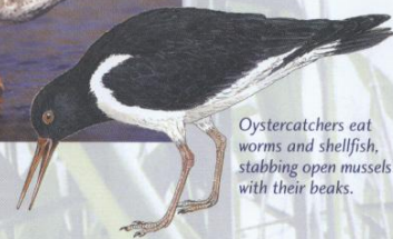
Oystercatchers eat worms and shellfish, stabbing open mussels with their beaks.