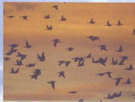
Pink-footed geese flying to their roost is a regular winter spectacle.

The wintering and migrant waterfowl that assemble along the inner Tay estuary are so numerous and diverse that the area is recognised as being of international importance for its bird populations. Goldeneye and cormorant, redshank and bar-tailed godwit, eider and shelduck, pink-footed and greylag geese congregate to feed and roost on the mudflats and saltmarshes at low tide.