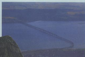
The Tay Rail Bridge forms the eastern boundary of the Inner Tay Estuary.

For more information, please contact: Scottish Natural Heritage Battleby, Redgorton Perth PH1 3EW Tel: 01738 444177