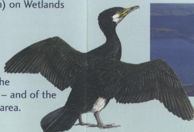
Cormorants hang out their wings to dry after diving for fish.

Conserving the estuary and its shores means working with the local community to agree how best to manage the habitats in the interests of the birds and plants – and of the people who live and work in the area.