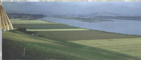
Fertile, mixed farmland borders both banks of the inner Tay estuary.

The rich farmland along both shores of the Tay results from glacial action which left fertile deposits at the same time as it carved out the bed of the river. To the north lies the Carse of Gowrie which is famed for its raspberries and to the south you can still see ancient woodland at Flisk Wood and Ballinbreich.