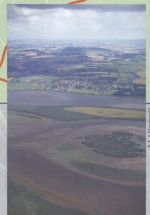
The Tay's patterns of land, water and sandbank are seen best from the air.

Private land restricts access to many stretches of the foreshore and it's best to ask locally for advice where there are no rights of way.