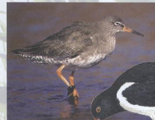
Redshanks, with their distinctive piping call, eat salt-marsh invertebrates.

This diversity is one of the reasons why the SSSI is so important – and it's equally important that the balance of species is not disturbed by human activity.