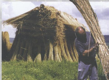
Harvested reeds near Errol are prepared for sale to thatchers all over the country.

Wildfowling still enjoy dawn expeditions along the estuary to shoot geese and ducks for their own tables.