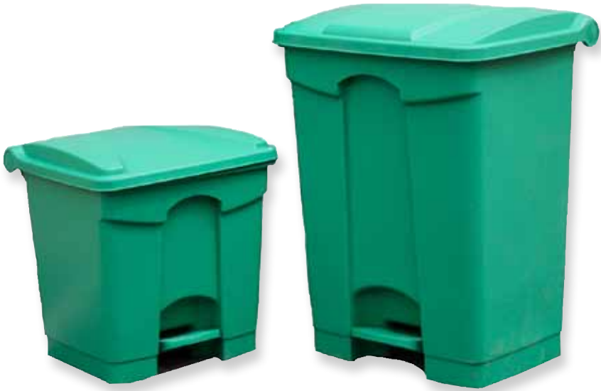
Robust, hygienic, and HACCP compliant