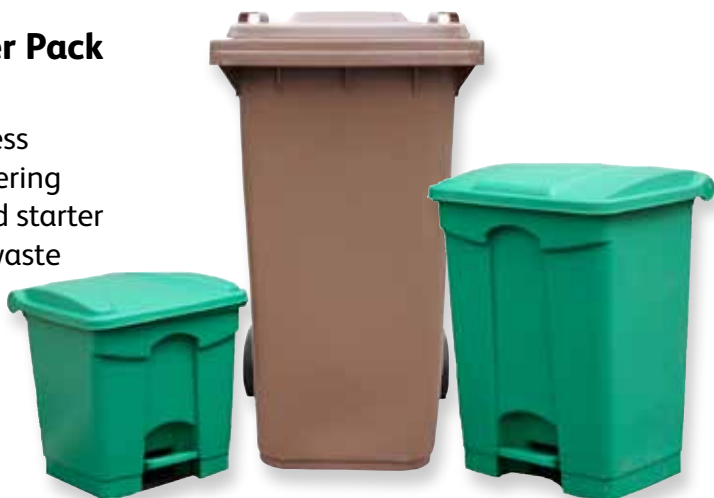
Internal food bins next to 240L wheelie bin

The packs include an external bin, an internal bin, and 40 x clear liners.