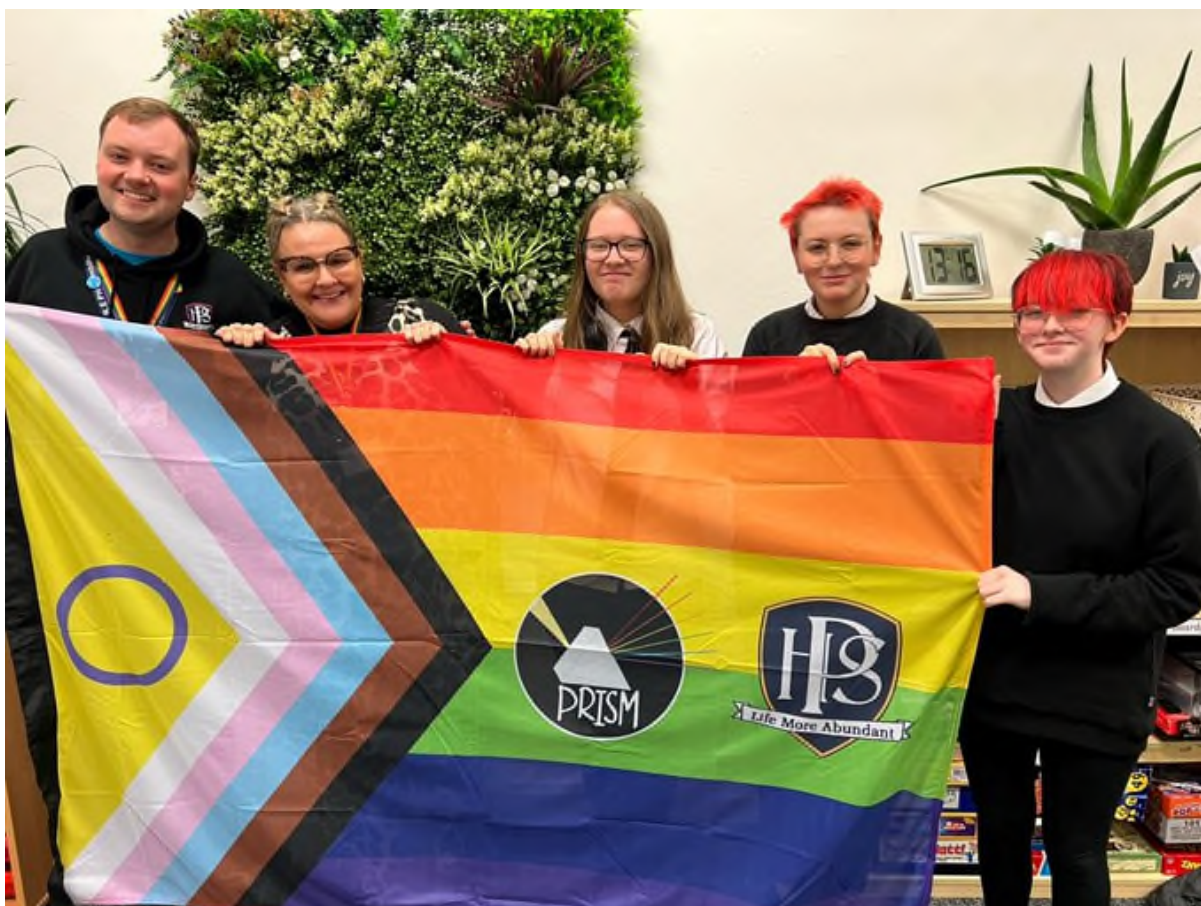
New PRISM Flag