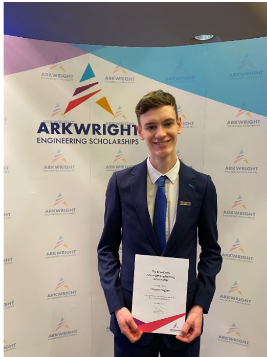
Arkwright Award Winner