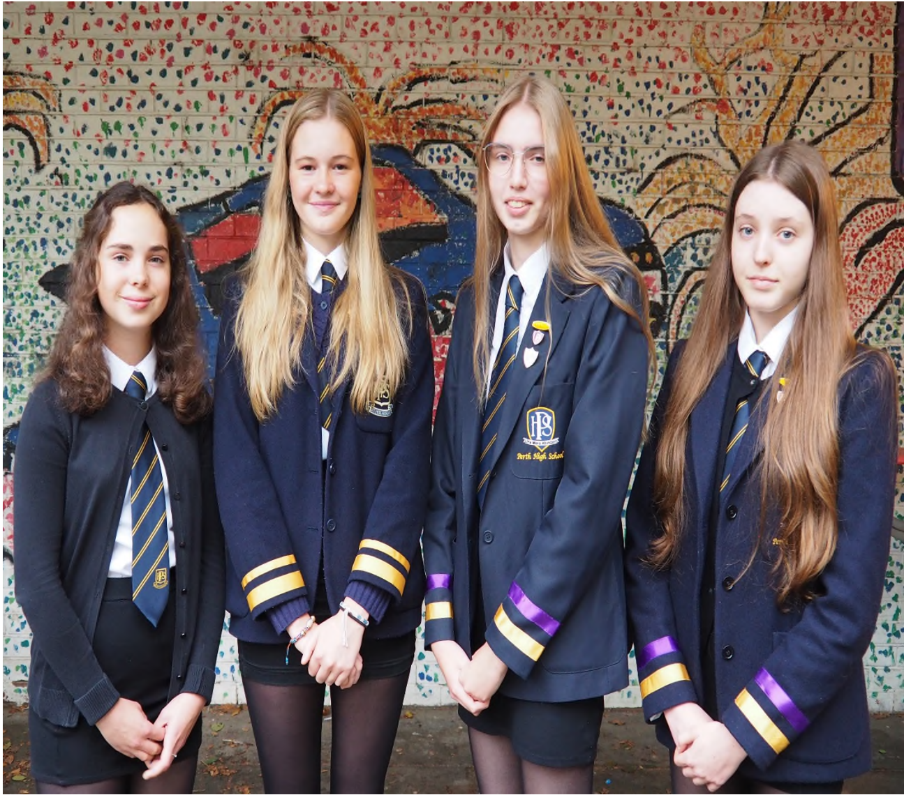
Perth High School Duxes