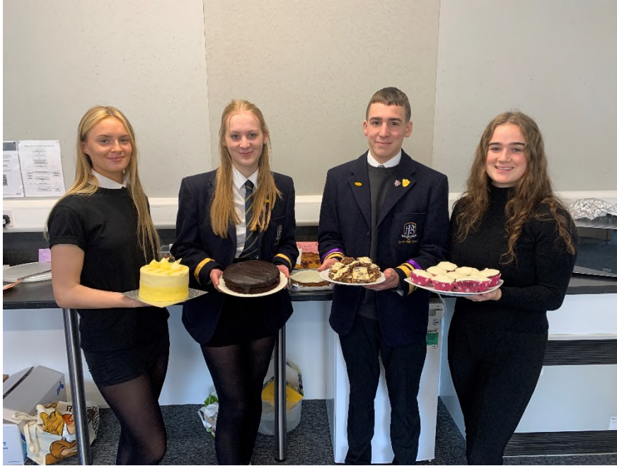
McMillan Coffee Morning