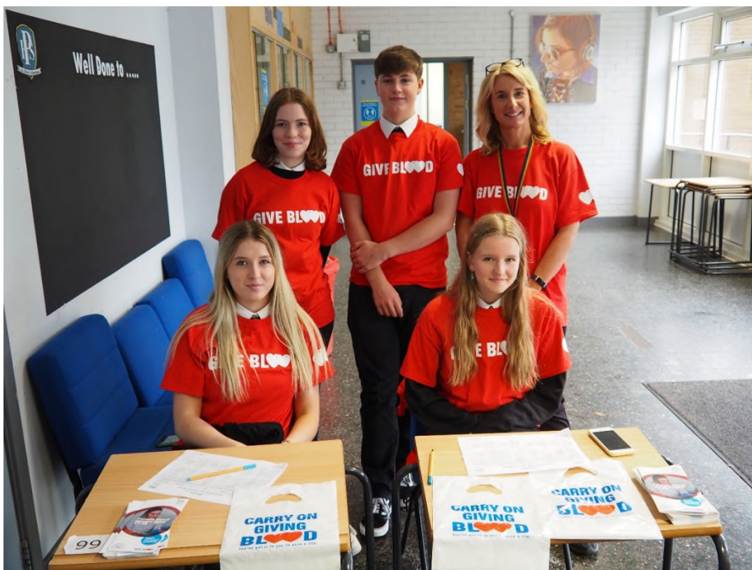
Blood Donation Event – Nolan Trust 2022/23