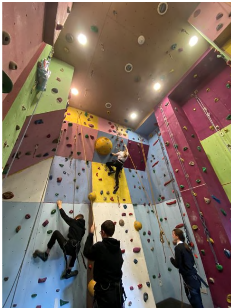
Climbing Wall Session

If unsatisfactory attendance persists, then cases may be referred to the Attendance Sub-Committee of Perth and Kinross Council. In extreme cases, parents have been prosecuted for failure to ensure their child's attendance at school. Our expectation is that parents will cooperate with us in ensuring that, barring illness, young people will attend 100% of all classes.