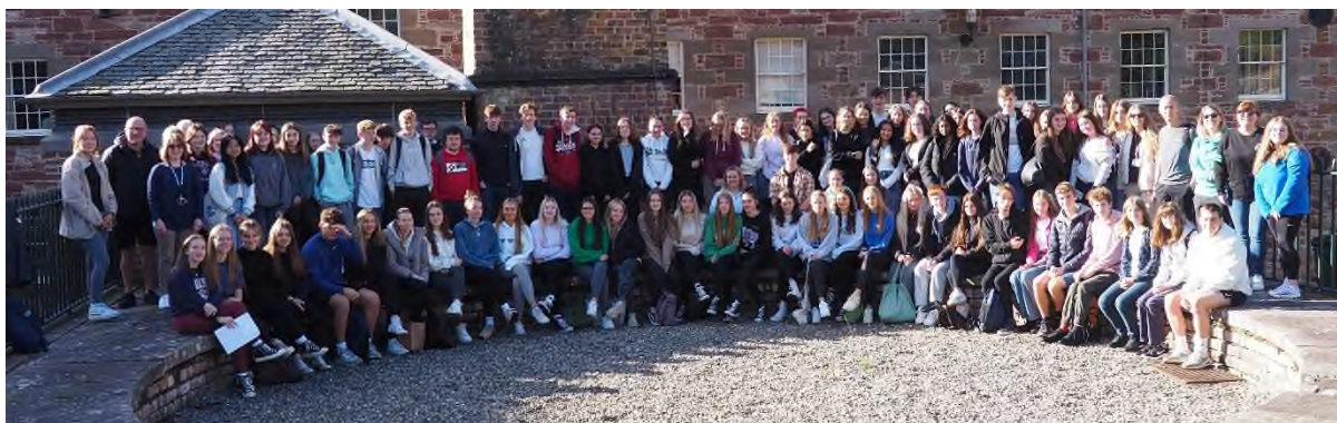
Prefects Training Day

Perth High School has a strong relationship with schools in South Africa and a trip there planned for senior Modern Studies pupils in 2024. A number of work-related, cultural, linguistic, educational and other links are developing from these arrangements and our young people have benefitted hugely from this program over many years.