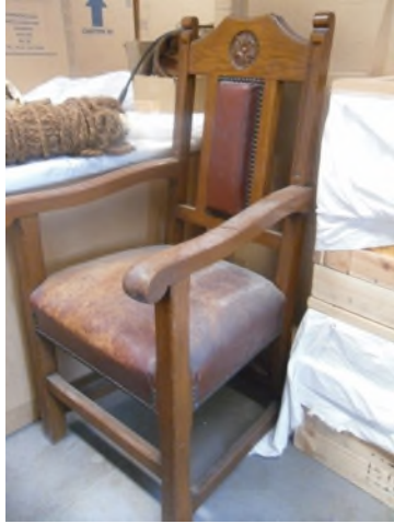
Magistrate's chair with rosette carving