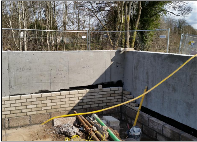
May 2015 – Construction of Main Street road drainage and continuation of flood wall construction around the Bowling Club. Mature tree felled.