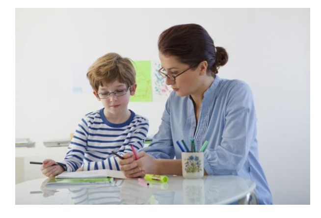
Speech & Language Therapist