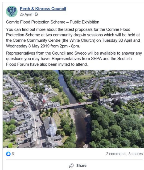
Figure 1 – Perth & Kinross Council Facebook post advertising the public exhibition

The local community was invited to attend the exhibition through the distribution of newsletters, personal letters/emails to interested parties and also through advertising posters displayed at local locations. The Council prepared a press release with details of the event appearing in 'The Courier' and on the Council's Twitter and Facebook pages.