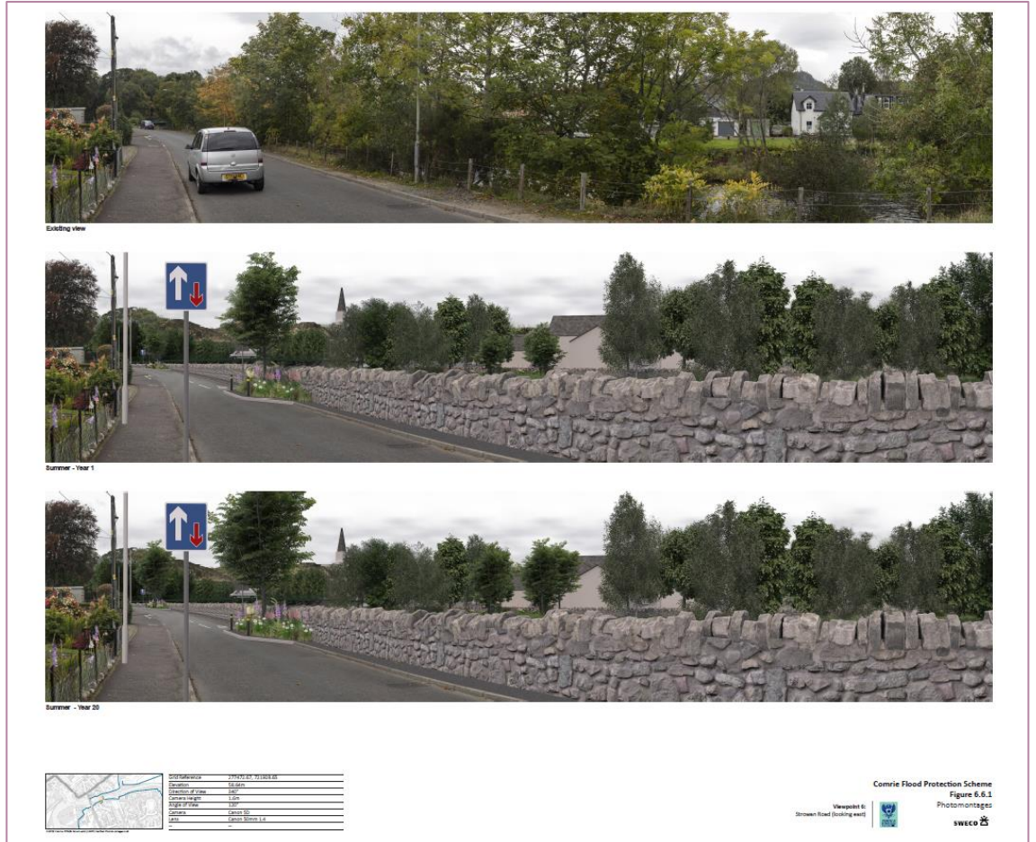
Figure 2 – Example flood scheme visualization for Strowan Road, Comrie

Tables were also set up to allow those attending to sit and view the available information and to discuss the proposals with the officers present. Members of staff from Perth & Kinross Council’s flooding team were available to discuss the proposals; as were members of staff from Sweco. On the 8th May event, SEPA and the Scottish Flood Forum were also in attendance and participated in advisory discussions with the community.