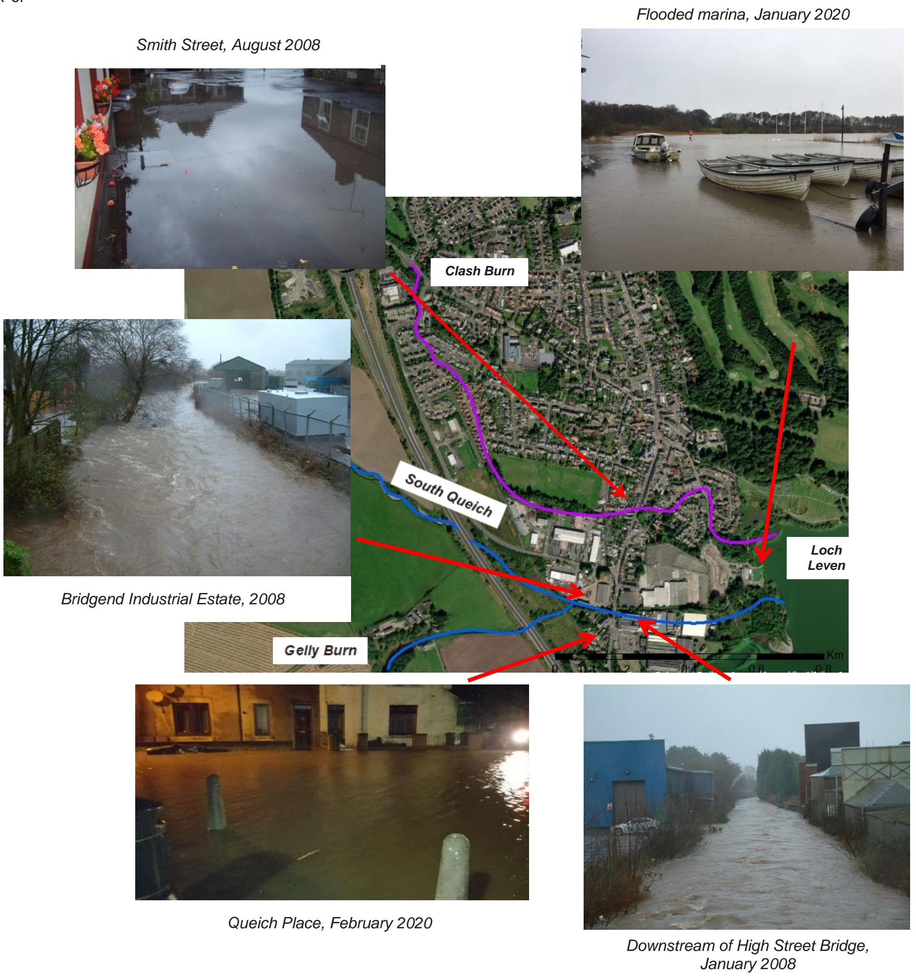
Figure 2 Historic Flood Locations