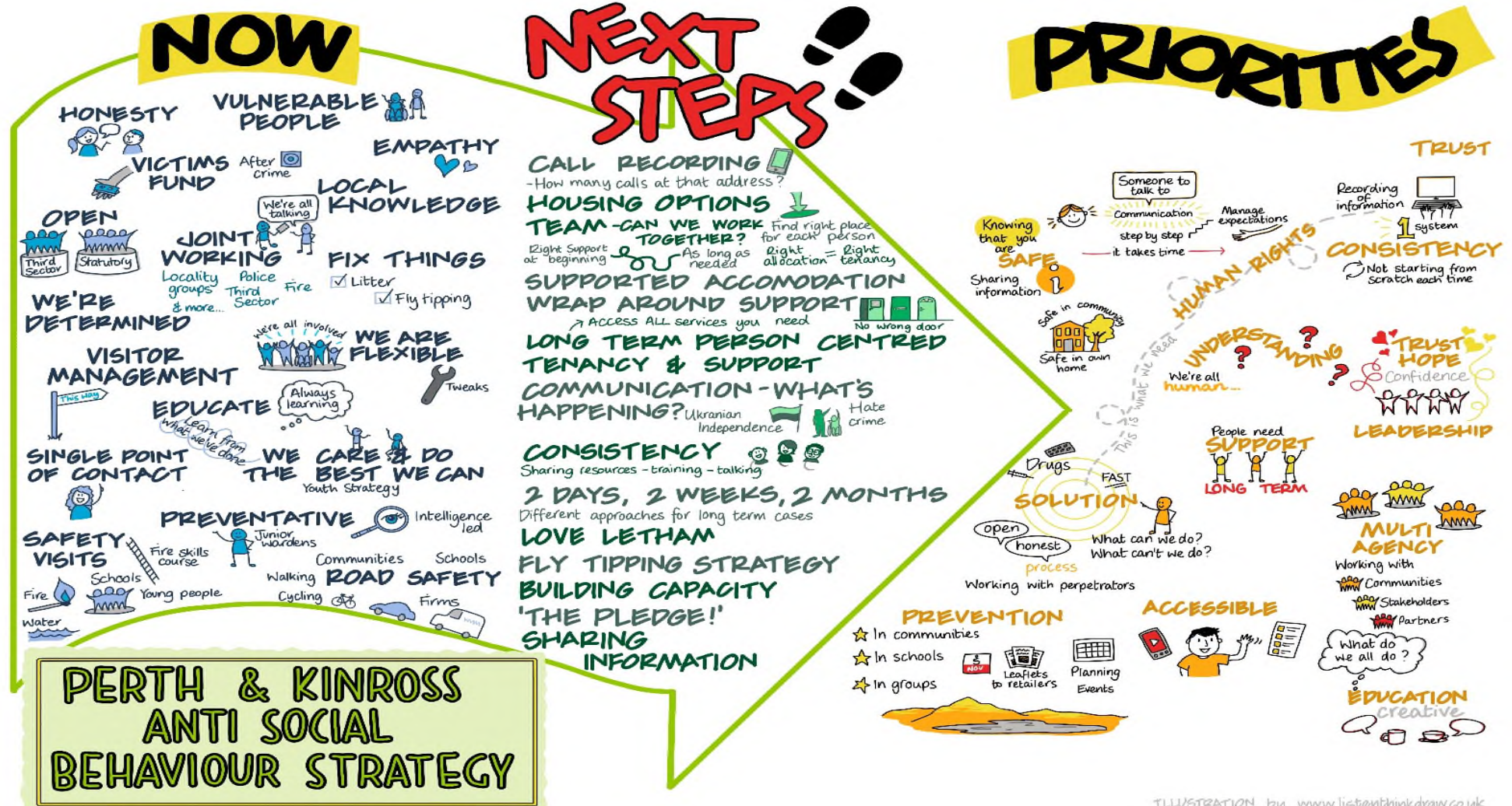
ILLUSTRATION by www.listenthinkdraw.co.uk