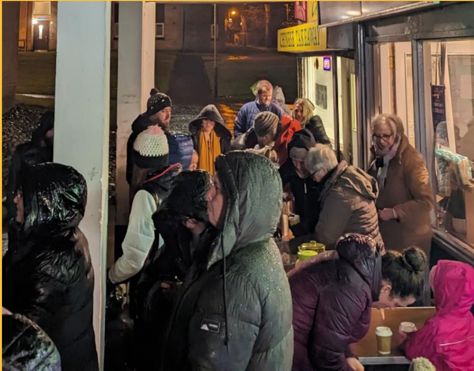
Tulloch Community Christmas Lights Switch On

"The (Stronger Communities) Network is a fantastic resource in the area, this is so beneficial to everyone who comes along to find out what is happening, sharing information and resources and being able to find out information such as funding and new developments is so important and encourages us to work together."