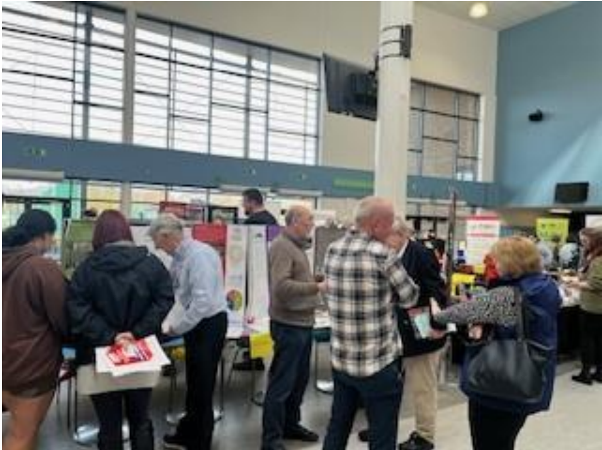
Strathearn Better Place to Live Fair 2024