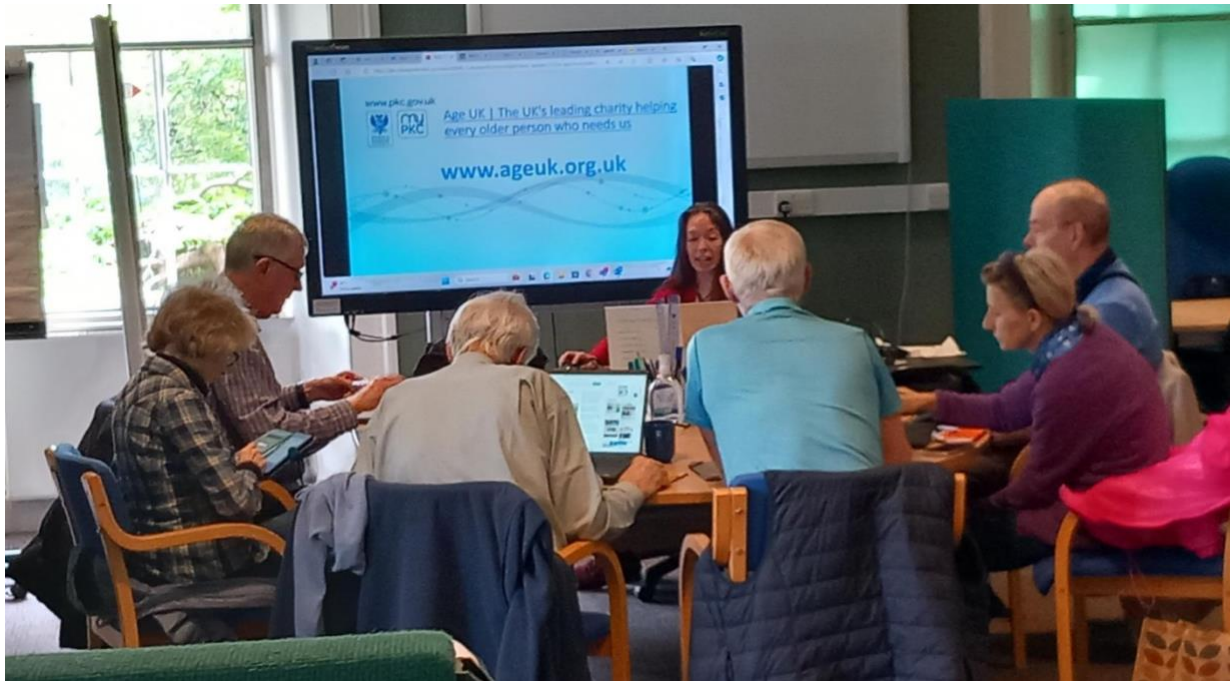
Digital skills class

'Thank you for your help, I got this English course from the Council, thank you for your interesting teaching, my English has improved, and it can help me in my daily life, I hope it can continue to help improve my English ability to integrate life in UK thanks.'