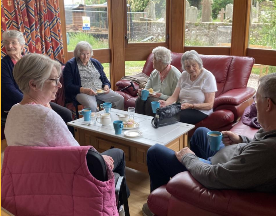
Warm Welcome in Bridge of Earn

"Abernethy Pavilion is a community asset and run as such. It's used for scouting, elderly groups, as well as football, Abernethy Amateurs and community events. The Community Investment Fund has allowed the committee to upgrade the building to make it fit for the next 30 years."