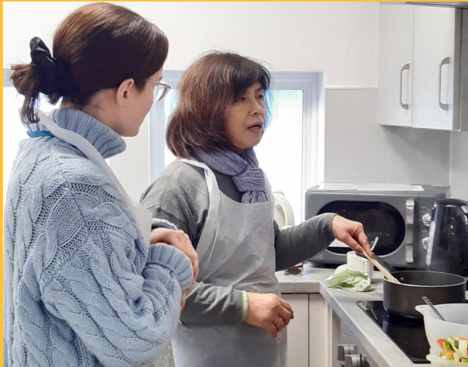
Community Cook It session

“I don't see other people apart from my children, unless I come here. I have been out of my comfort zone, but I have enjoyed trying new foods, getting out the house and learning about where my food comes from. Trying different things and learning new cooking skills has been brilliant. Helpful support with nutritional advice. Location is fab!”