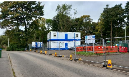
Figure 1: Field of Refuge compound

A satellite site compound has been formed at the Field of Refuge car park meaning public parking will not be available for the full duration of the flood scheme construction.